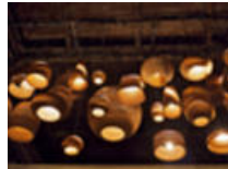
Everything old is new again