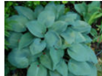
A sense of humus