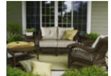
Debbie Travis: Coated wicker more...

Text Size Email this Article Print this Page Report Typo or Correction BOOKMARK