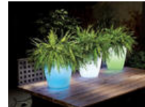
Add some twinkle to your summer...